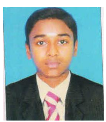
R.Parkavan Instrumentation & Controls