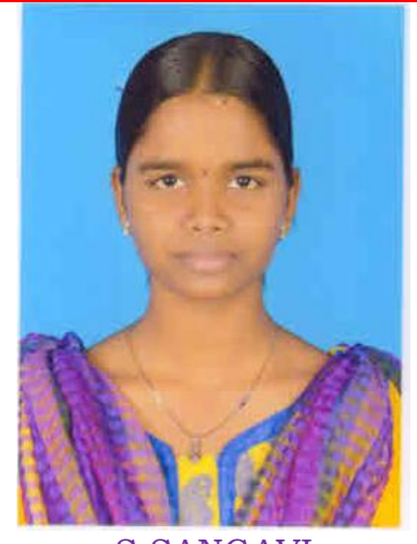
S.SANGAVI Electrical & Electronics