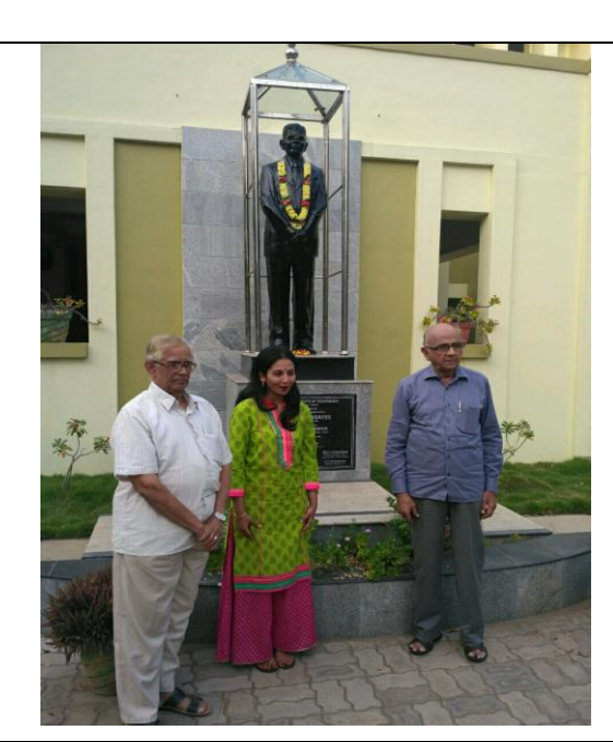
In front of founder's statue