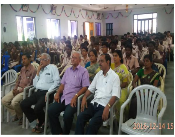
A view of Participants – Gathering attending lecture programme