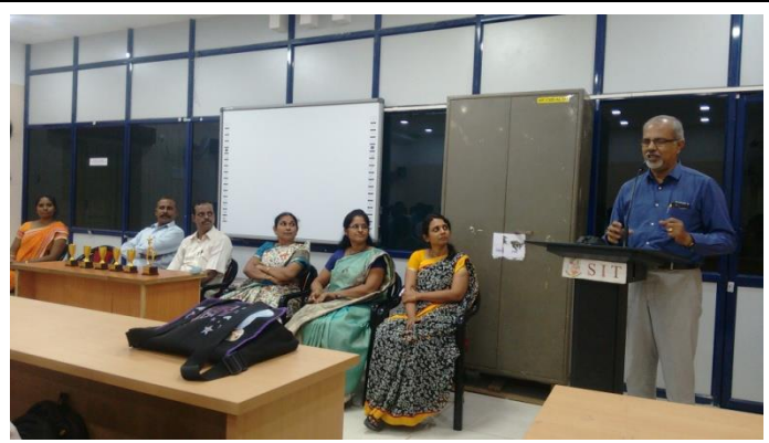
Career development programme