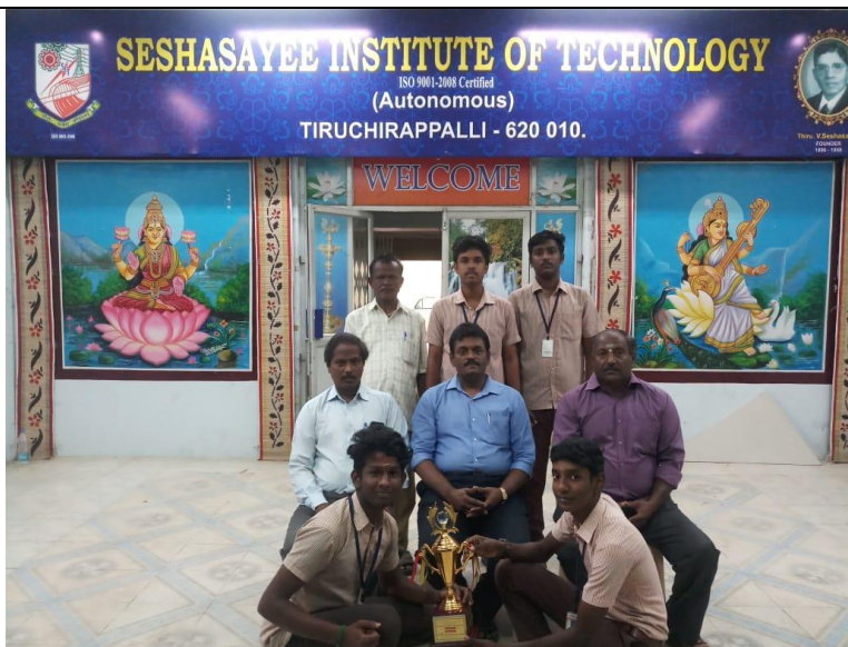
Table Tennis Association winners

Our college team emerged winners in the Interpolytechnic Athletic Association, Trichy Division Table Tennis tournament held at Rane Polytechnic college, Sethurappatti, Trichy on 8.9.2018