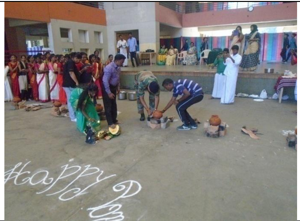
Inauguration of Pongal Celebrations