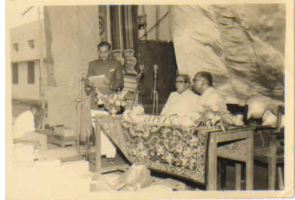
Annual day celebrations 1958