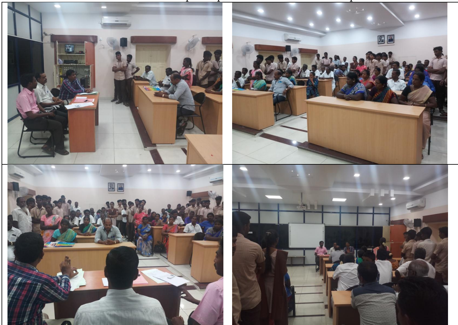
Parents – Teachers – Students discussions at SIT on 16-05-2018

The meet was conducted with active participation of the students and parents.