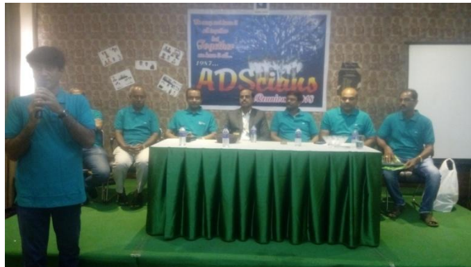
One of the ADSC Alumni's felicitation