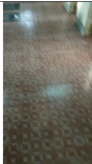
Renovated flooring of bath rooms