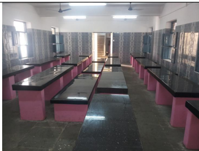
Renovated dining hall – Eastern side