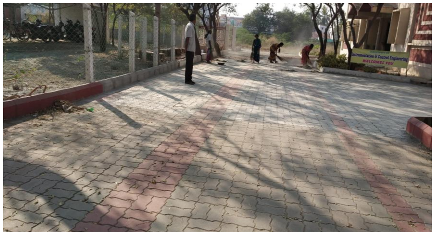
Paver work in front of ICE department – 3000 Sq.ft. completed