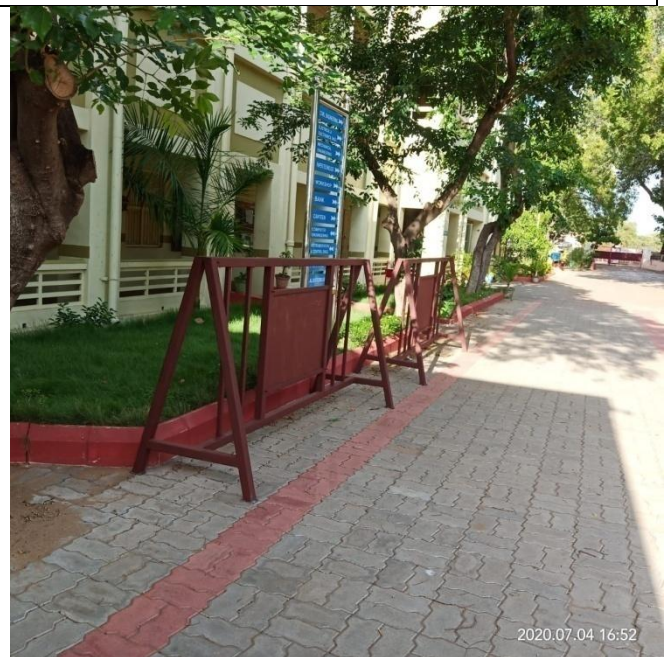
Arranged Barricades, sign boards