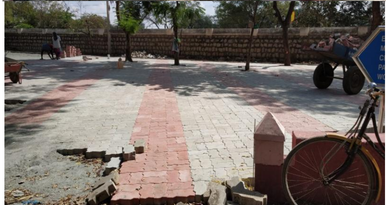
Paver laying - East gate entrance for car parking - 5000 sq. ft area completed