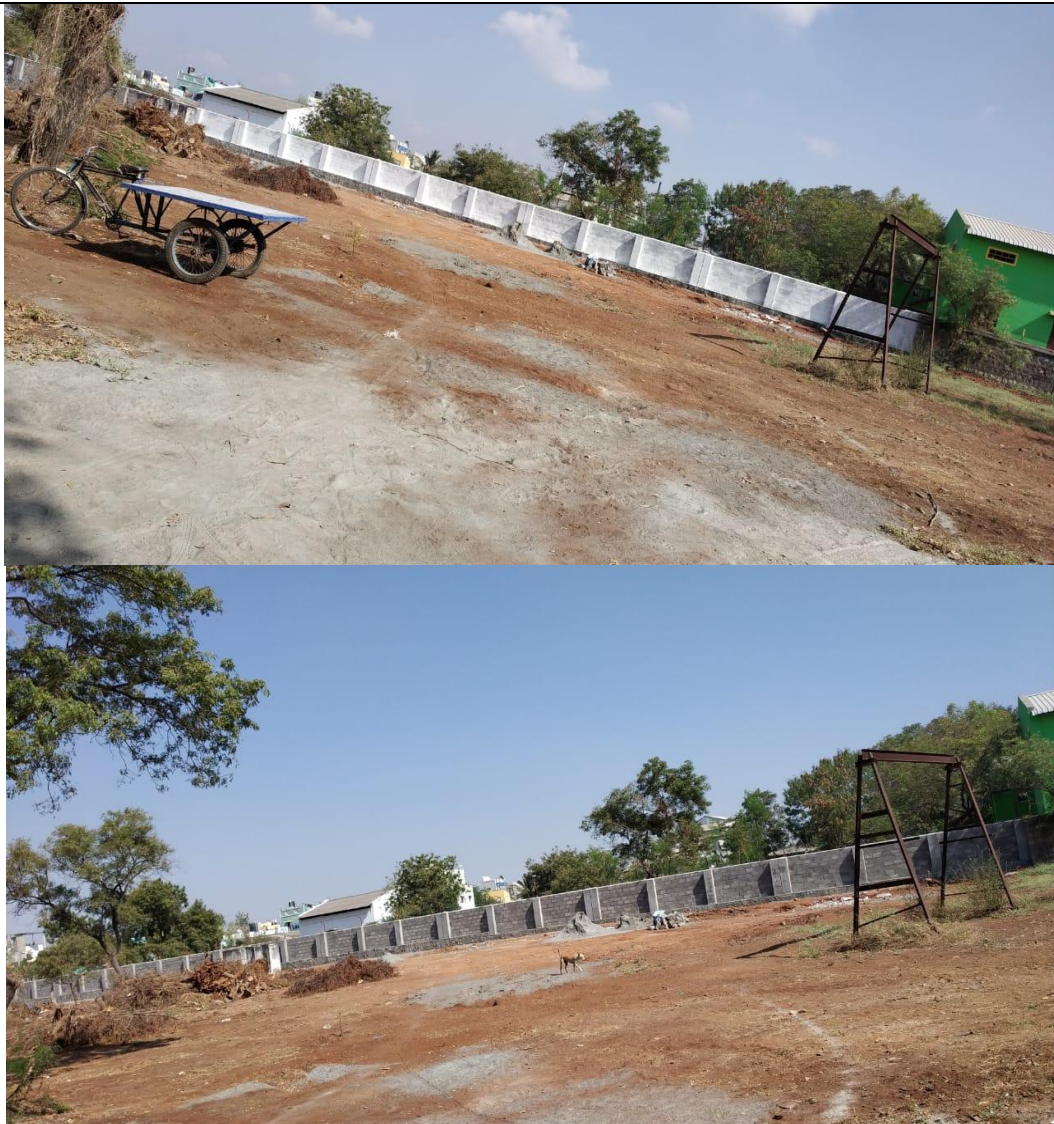
NORTHERN COMPOUND WALL 300 FEET CONSTRUCTION COMPLETED

Compound wall – Northern side of SIT construction :