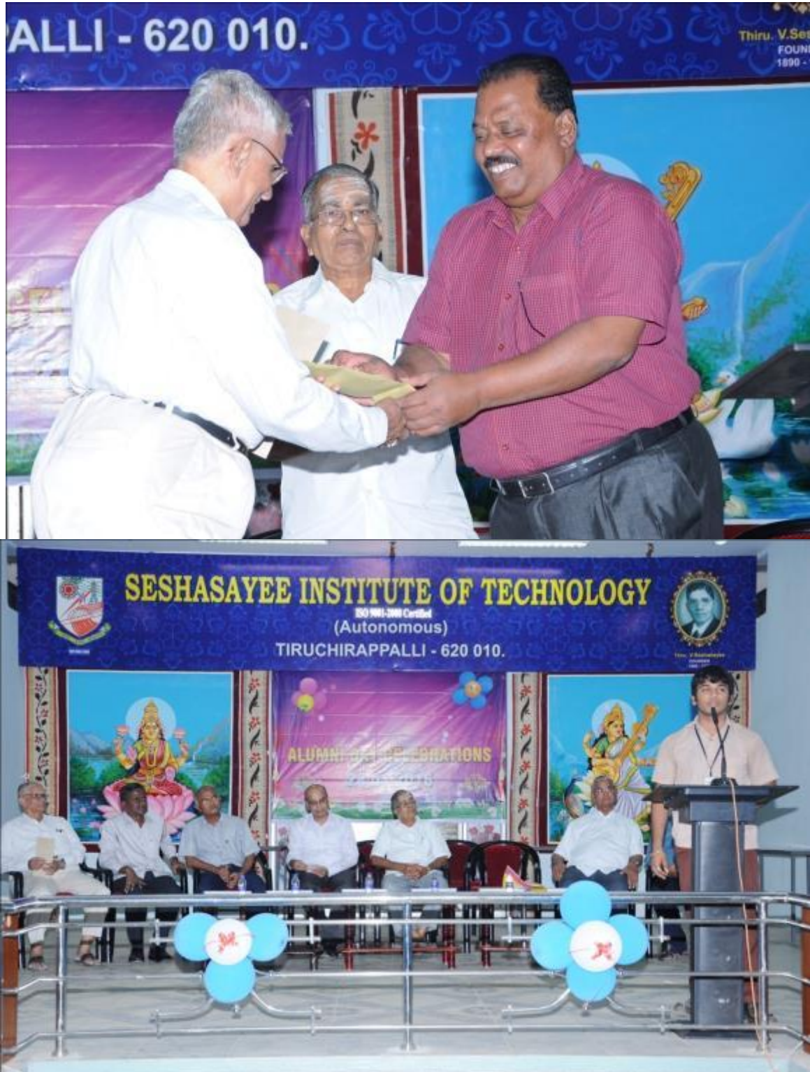
Ongoing student expressing his views