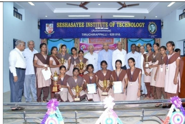
Team of Students won the trophy along with the Chief Guest