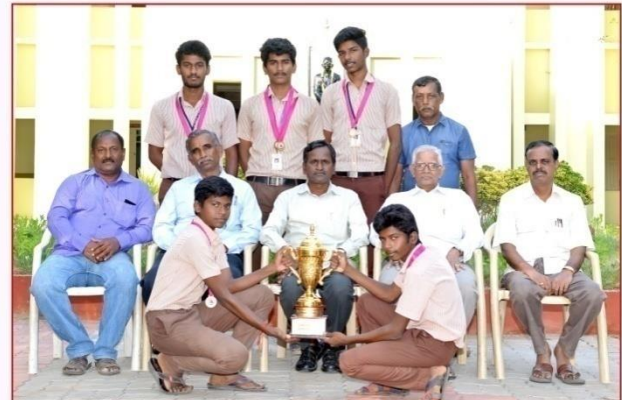
Teams won the first prize and the overall championship with Hon Secretary, Principal, Vice Principal, HOD, Civil Department and Physical Director of SIT