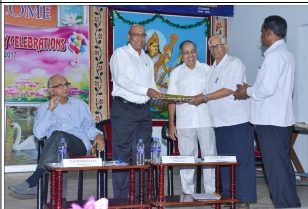
During National Anthem