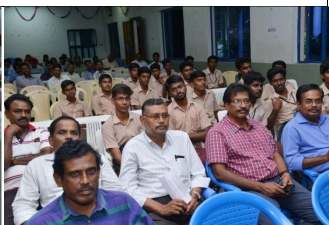
Felicitation by alumni, participants