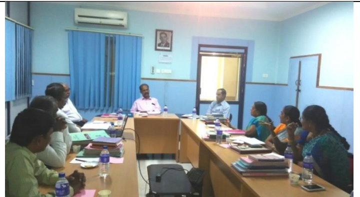
Autonomous assessment review committee members during review