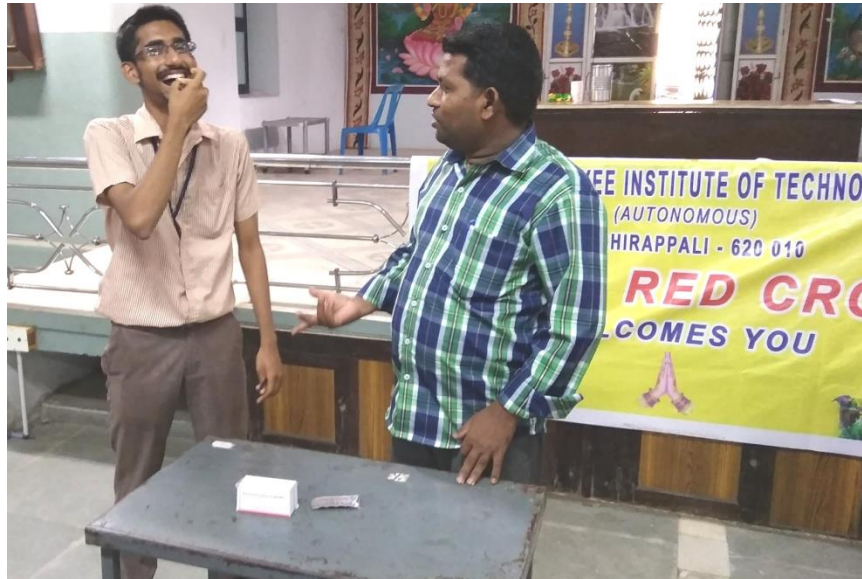
Student consumes deworming tablet