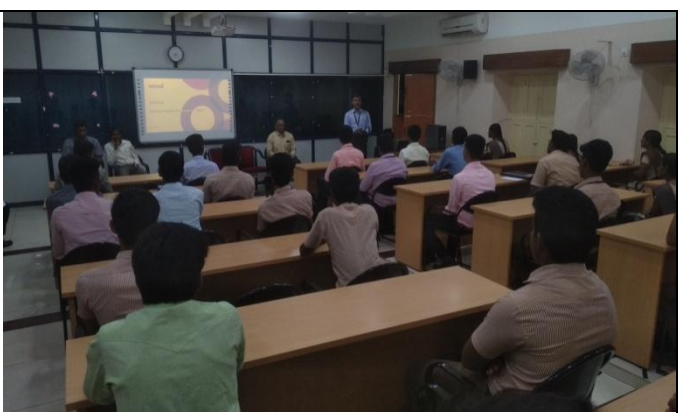
Amec Foster Wheeler PLC (Wood) HR addressing the students