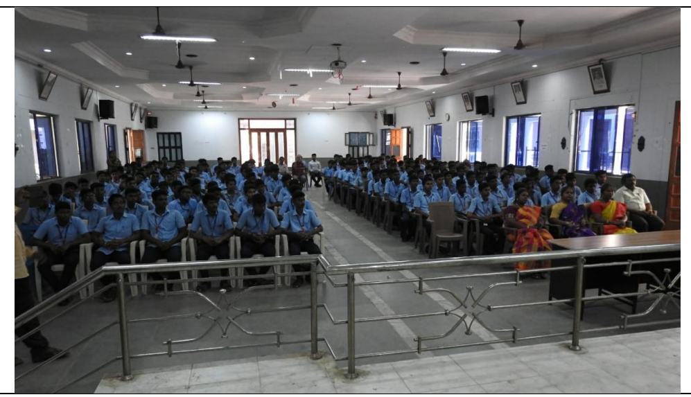
Corona awareness program for our students