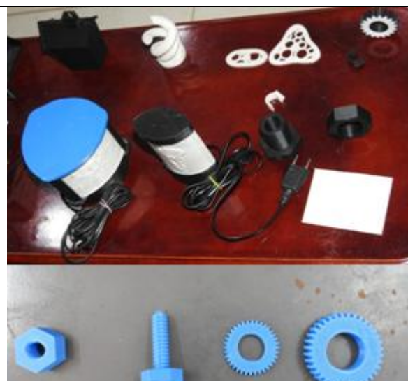
Components made in One day workshop on 3D printing by Mechanical Dept