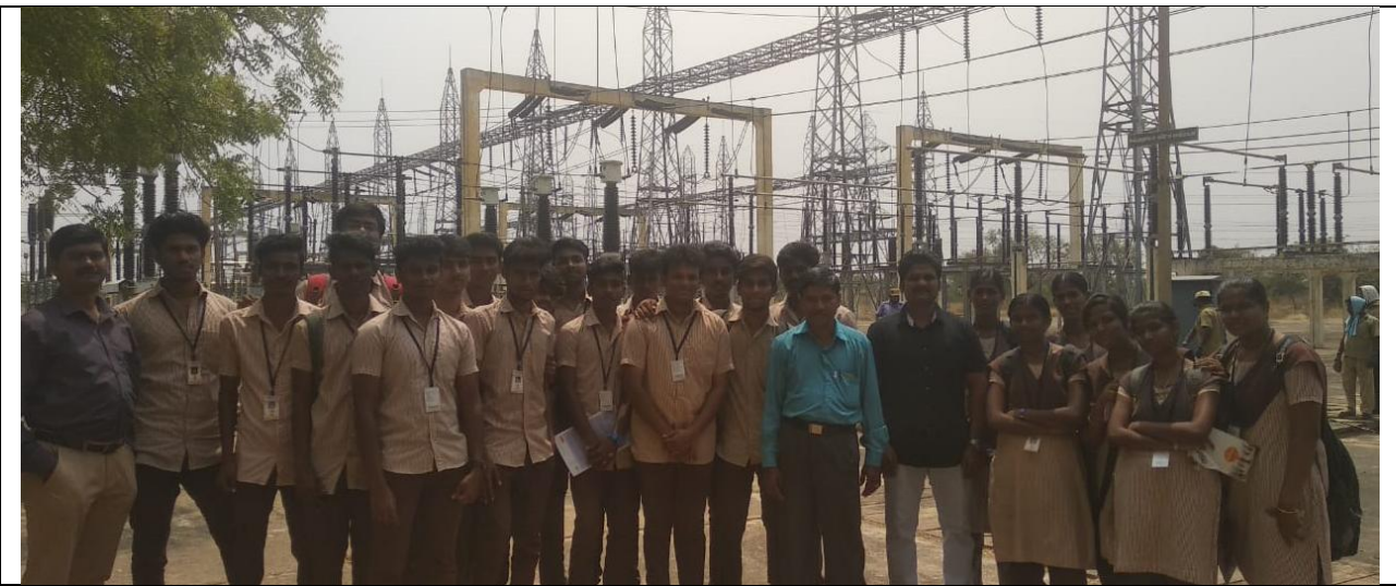
Industrial Visit of Final year EEE students to 230KV/110KV Substation at Alundur