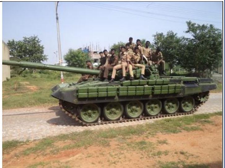
NCC Cadets of SIT in action in the Army Attachment Camp