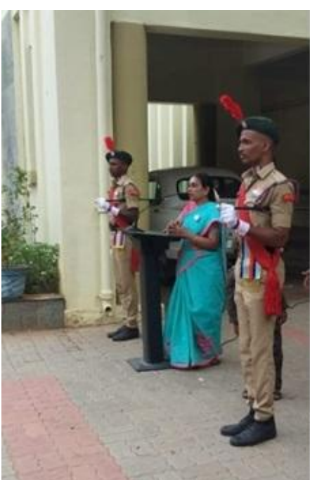
Page 6 of 23