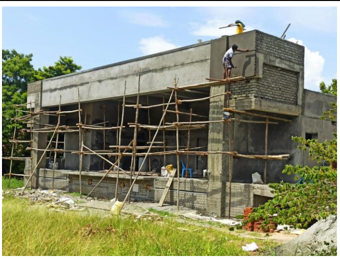
GS-ANC Open Air Auditorium – Construction is completed. Flooring, Plastering, plumbing, painting, electrical fittings are yet to be carried out. Planning to inaugurate in a couple of months.