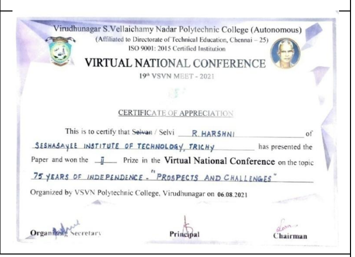
SIT & SITAA Congratulate the winners and wishes to achieve further laurels in their career.