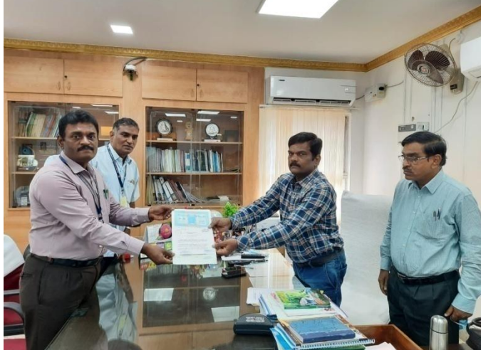
Chief Engineer Cum Director General, Irrigation Management Training Institute, Thuvakudi, Trichy on 20-09-21